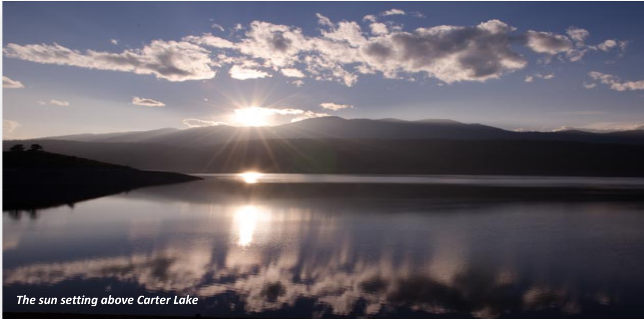
The sun setting above Carter Lake